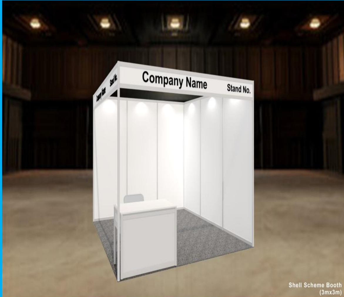
Shell Scheme Booth (3mx3m)